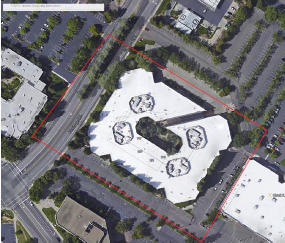
Sacramento Campus Clery Geograpy Map

1610 Arden Way, Suite 110 Sacramento, CA 95815. The area outlined in RED represents the Sacramento College Campus.